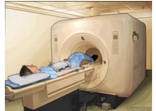
© 2005 Terese Winslow, U.S. Govt. has certain rights

Diagnostic tests look for the disease when breast cancer is suspected because of symptoms. One diagnostic test is an MRI. An MRI looks at areas inside your body by using a magnet and computer that make detailed pictures. Blood tests and bone scans are two other diagnostic tests. Also, a mammogram and ultrasound are other diagnostic tests.