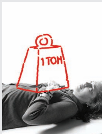
PUTIN PECHU, CHATGUIYA, SINIENTIN MAHOHONU YAN KULAN GUAHA GOF MAKAT HUMOHOCSI I PICHU-MU